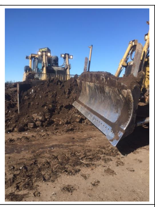
DOZER CLEANING DOZER BLADE