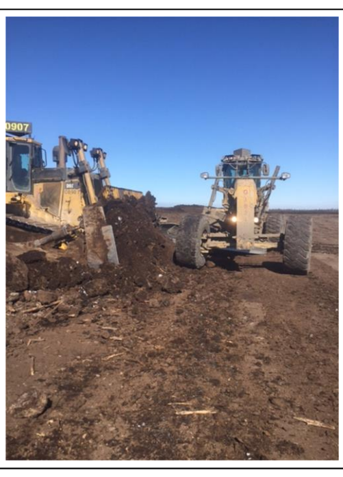
GRADER CLEANING DOZER BLADE